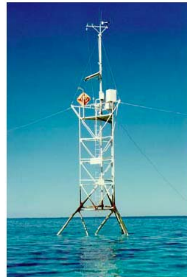
Davies Weather station

Phase 2. Medium term goal (Mar 2006 – Sept 2006) - Pilot short range sensor mesh on Davies established.